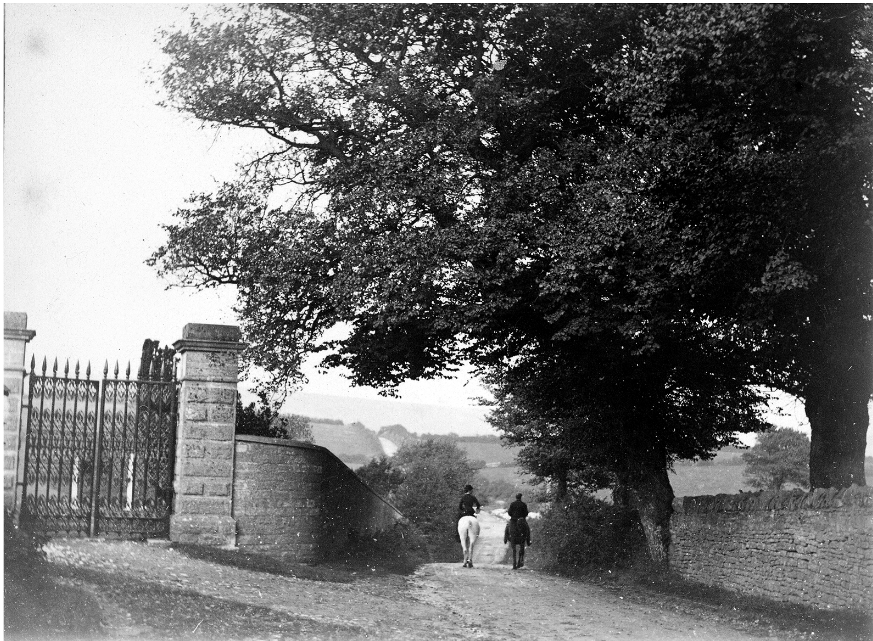
APPENDIX A : Northbrook Lane, c.1895