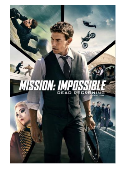
Doors and bar at 7 pm - Film at 7.30pm Tickets for sale on the door only - £5.00