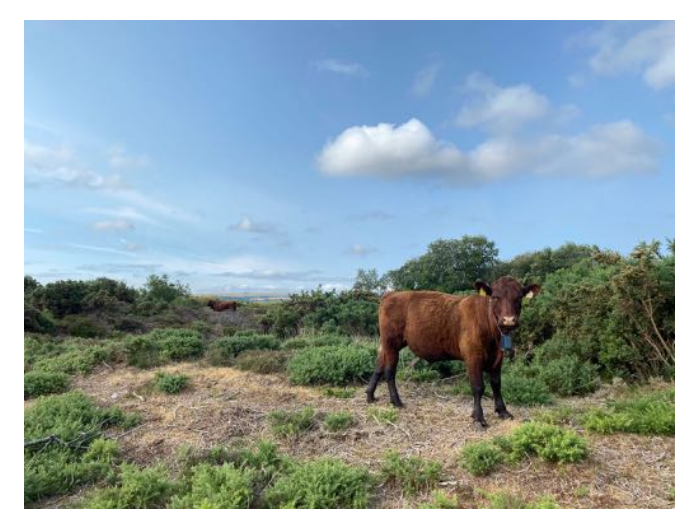
Cow with GPS collar.