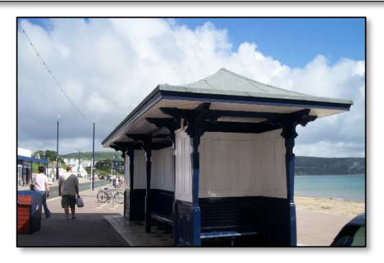
The iconic blue shelters, Shore Road