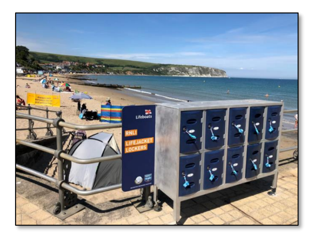
RNLI Lifejacket Lockers, Banjo Pier

The Town Council also supports the local services provided by a range of countywide and national organisations. As well as Dorset Council, the Town Council works with NHS Dorset (formerly Dorset CCG), Dorset Police, Maritime & Coastguard Agency, RNLI and National Coastwatch Institution. The Town Council seeks to lobby and influence decision making bodies to protect and enhance the quality of services provided to the local community, as it has done most recently in respect of the Swanage & Purbeck Ambulance Car.