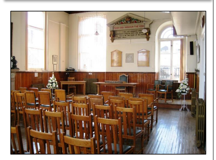
Town Council Chamber, Town Hall

Between 2022 and 2025 the Town Council will: