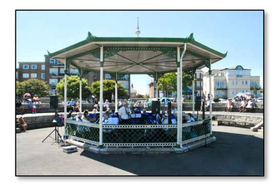
The restored bandstand

Taken the operation of Swanage Market in-house and expanded its operation year-round Replaced and upgraded the Festive Lights