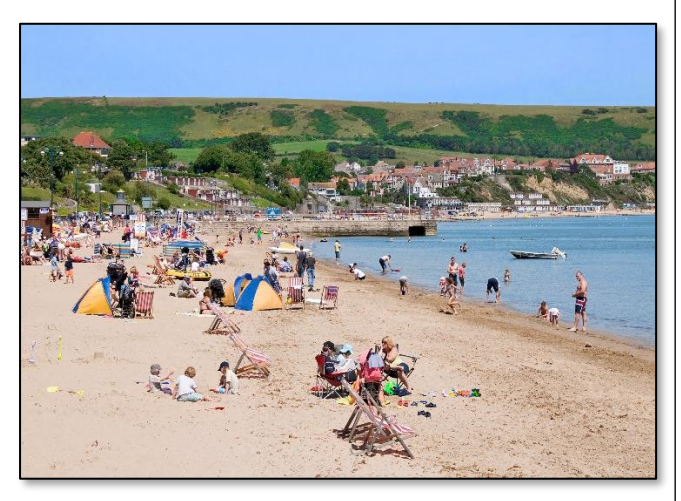
Swanage's award-winning Main Beach