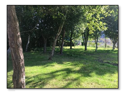
Former St Mark's Playing field