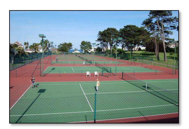
Tennis Courts at Beach Gardens