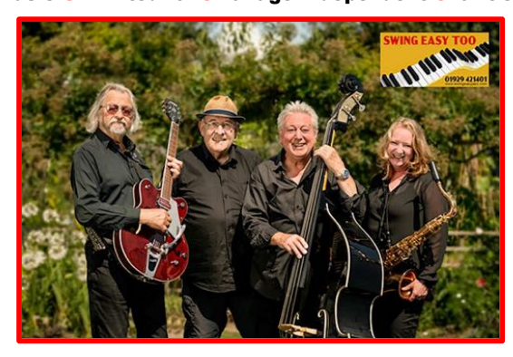
LIVE MUSIC: SWING EASY TOO (4-piece band, vocalists) plus Guests

(Music Unlimited for Swanage Independent Charities)