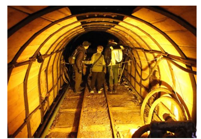
Local families had the opportunity to see the underground tunnel at the Purbeck Mining Museum throughout the Community Weekend