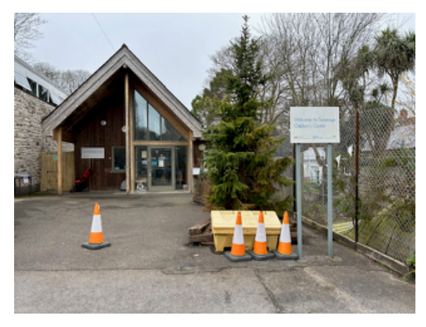
The Children's Centre

SPDT will be providing regular updates on the progress on site, soon to be renamed, the "Focus Centre", with a particular focus on wellbeing, children and families and support for the local Community generally, including Swanage and surrounding villages.