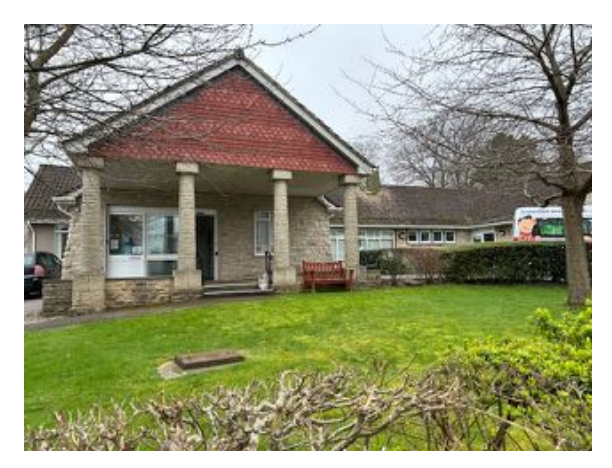
The Day Centre