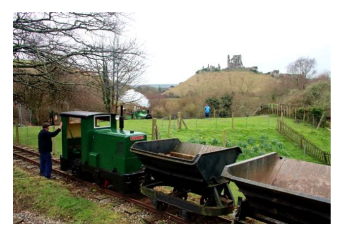
There were demonstrations of engine and wagon movements on the restored narrow-gauge clay railway at the Purbeck Mining Museum throughout the Community Weekend

The Purbeck Mining Museum will be open to the public from 11am to 4pm during the Swanage Railway's special Victorian Weekend (22-24 March 2024) and will reopen for the 2024 season at Easter. Full details on opening times are available on the website - <a href="www.purbeckminingmuseum.org">www.purbeckminingmuseum.org</a>. And, anyone wishing to enquire about volunteer opportunities should send an email to purbeckminingmuseum@swanagerailway.co.uk.