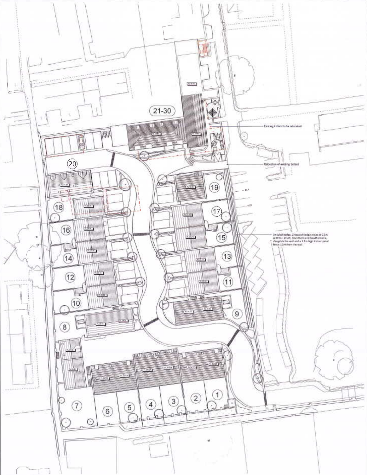
Proposed Site Plan 1:200@A1