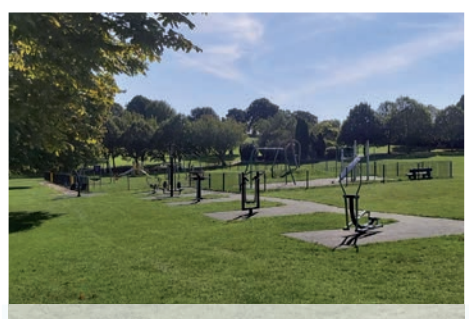
Play area and exercise equipment at Days Park