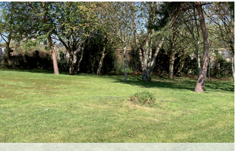
Former St Mark's Playing field