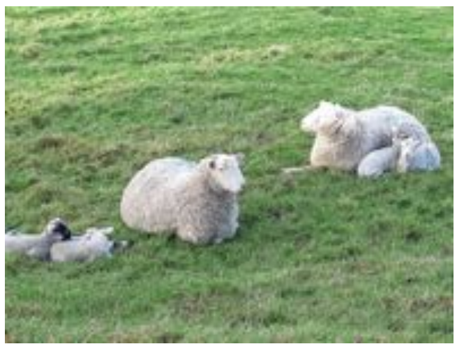
Purbeck sheep and lambs.

We know that many people support the ambition to ensure that Dorset's very special environment, wildlife and heritage will be cared for, for future generations. We welcome the government's proposal to help make National Parks even better places to live in and visit by giving National Park Partnerships, working with local authorities, increased powers to help manage visitor pressures, including traffic.