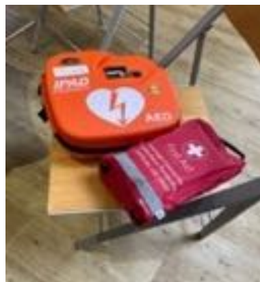
The recovered defibrillator