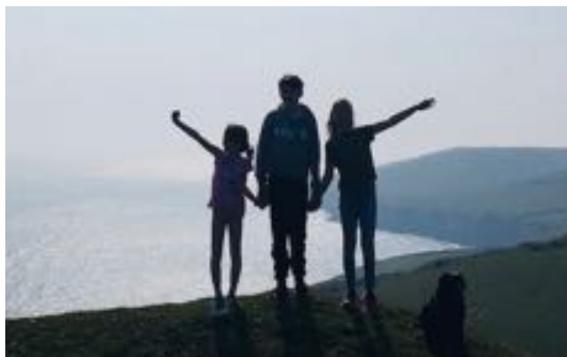
Children enjoying the coast